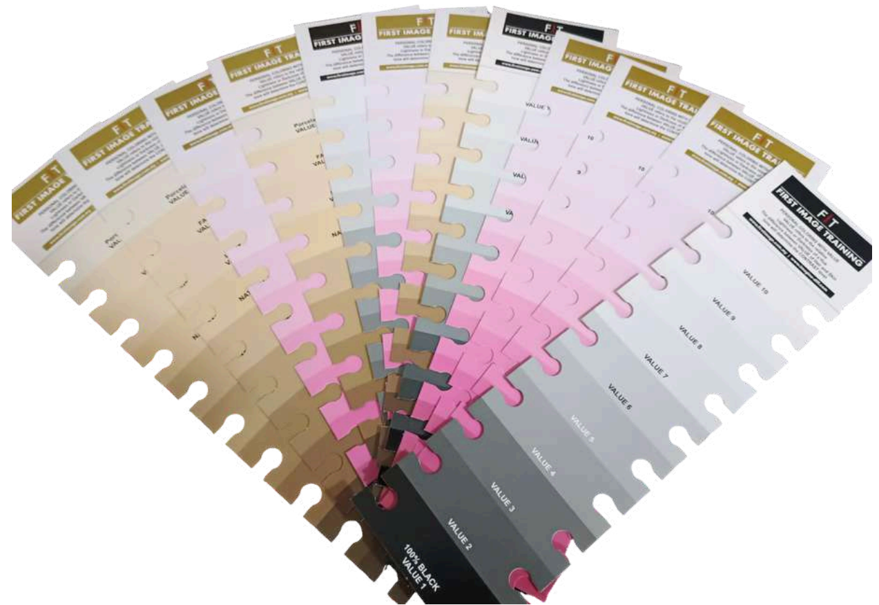
78 PCS FIT COLOR DRAPES